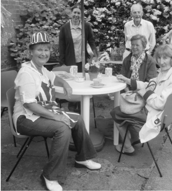
Pictured at the Tea Party