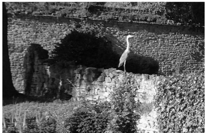
A Heron anticipates breakfast at the Sutton Wick Pond

If you have been affected by this, or any other scam, report it to Action Fraud by calling 0300 123 2040, or visiting www.actionfraud.police.uk