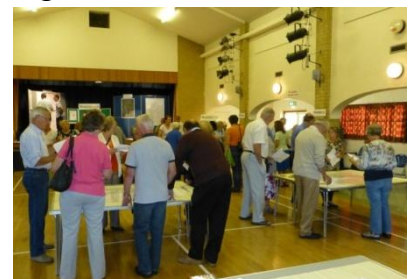
Drayton2020 Launch at 'Curry Night'