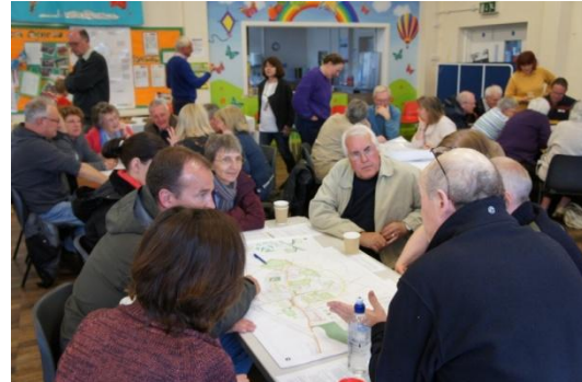
'Tea party' Consultation afternoon at Drayton Community School – 12 th May 2014